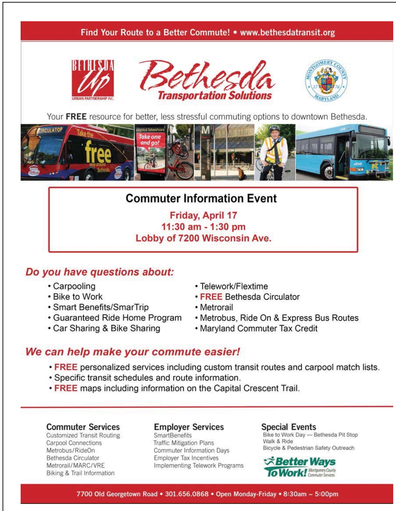
Figure 3.1 Example of CID Flyer