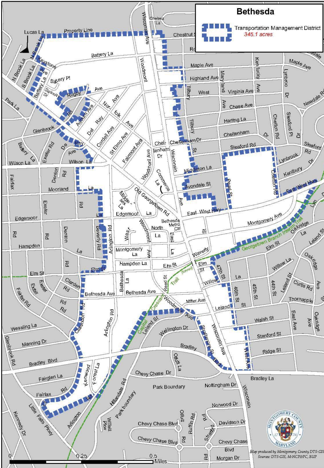
Figure 2.1 Map of Bethesda Transportation Management District